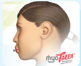
MRC's activities program and fast track for all age groups