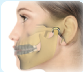
Immediate diagnosis and treatment of TMJ Disorder