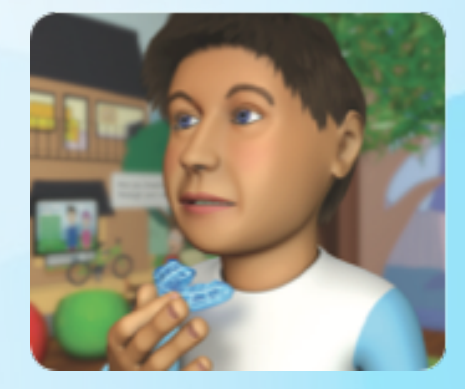
Myofunctional Orthodontic treatment for ages 3-15.