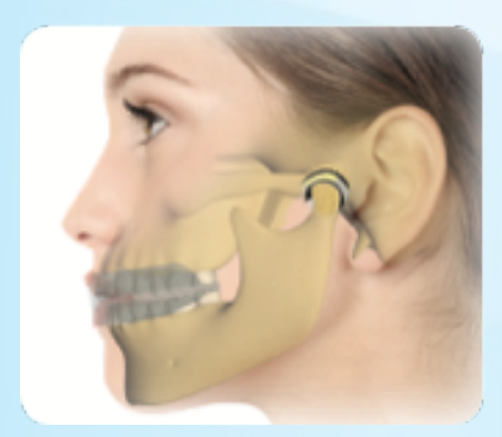
Immediate diagnosis and treatment of TMJ Disorder.