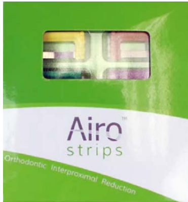
Airo Strips Intro pack DB05-0908 pcs

An innovative Interproximal Reduction system that makes interproximal enamel removal / stripping safer and more accurate without creating sharp corners or subgingival ledges.