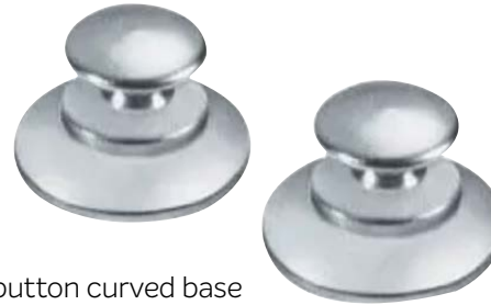
Lingual button curved base 42-0010-0000

Bondable lingual buttons are used in dental movements such as retractions, rotations, pull and anchoring systems. This retains the elastic, wires, chains and ligatures.